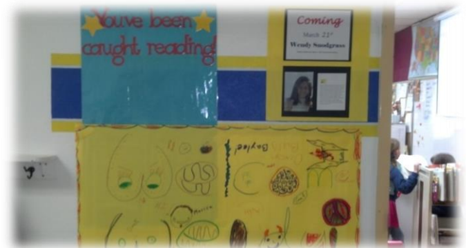
Valley View in Bonner's Ferry, Idaho